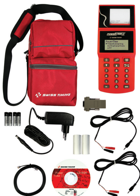
POWER TIME II ready-to-use pack content