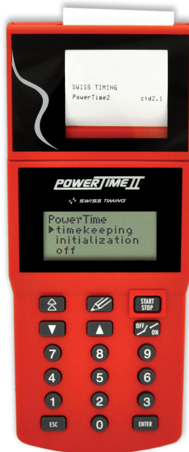
POWER TIME II timing device with its integrated printer

POWER TIME II is a hand-held timer with integrated printer for athletics, ski and swimming competitions. It integrates all the experience of Swiss Timing's official timekeepers of over 25 Olympiads. The device is composed of a 24 digits printer and a 4x16 digits LCD. Despite its small size, nothing has been left behind to assure ease and comfort of use for the operator. Firmware updates and dedicated softwares are available on our website and can be downloaded through the serial port. POWER TIME II features several in/out connectors allowing various peripherals links such as a starting system. A combined RS232/RS422 serial port allows it to connect to a scoreboard and a PC for the display and the transfer of the results. Thanks to the peripherals, the system is able to process athletics, skiing and swimming competitions. POWER TIME II can also be used as an ideal complement to other timing devices in registering the start and arrival times in any sports event, measuring speed or lap times among many other applications. It can register and store up to 2000 entries. High precision, easy to use and friendly interface, compact size and low power consumption makes the POWER TIME II a highly practical solution for all disciplines requiring the measurement of time. It is suitable for every timekeeper, from amateurs to professionals, having already been used at various Olympic games.